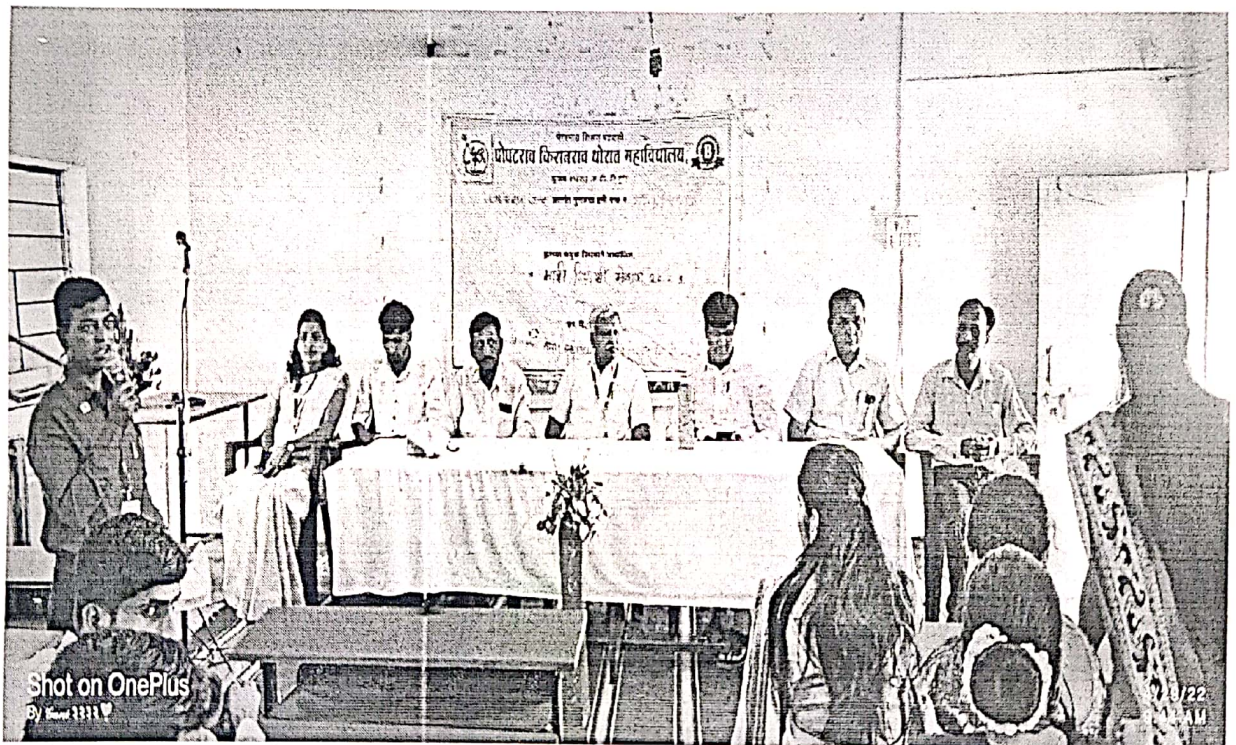
Stakeholders at Alumni Meet-2022